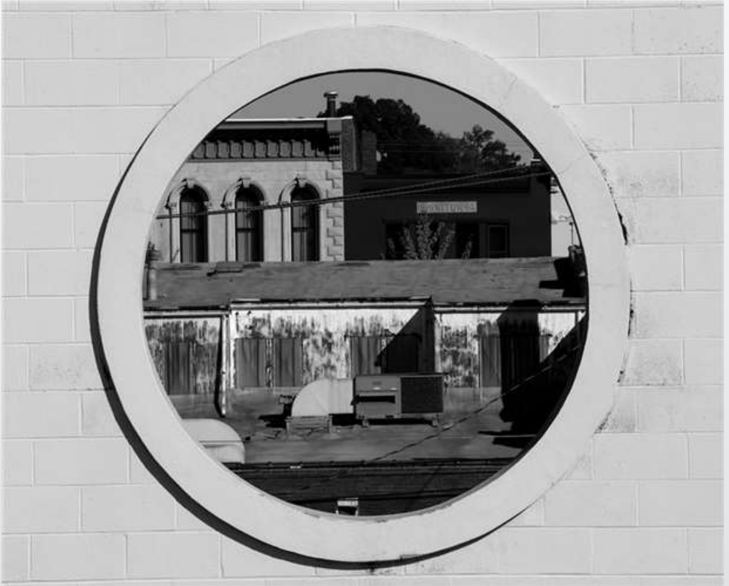
Chris Carter Photography “Complexity in 2D”