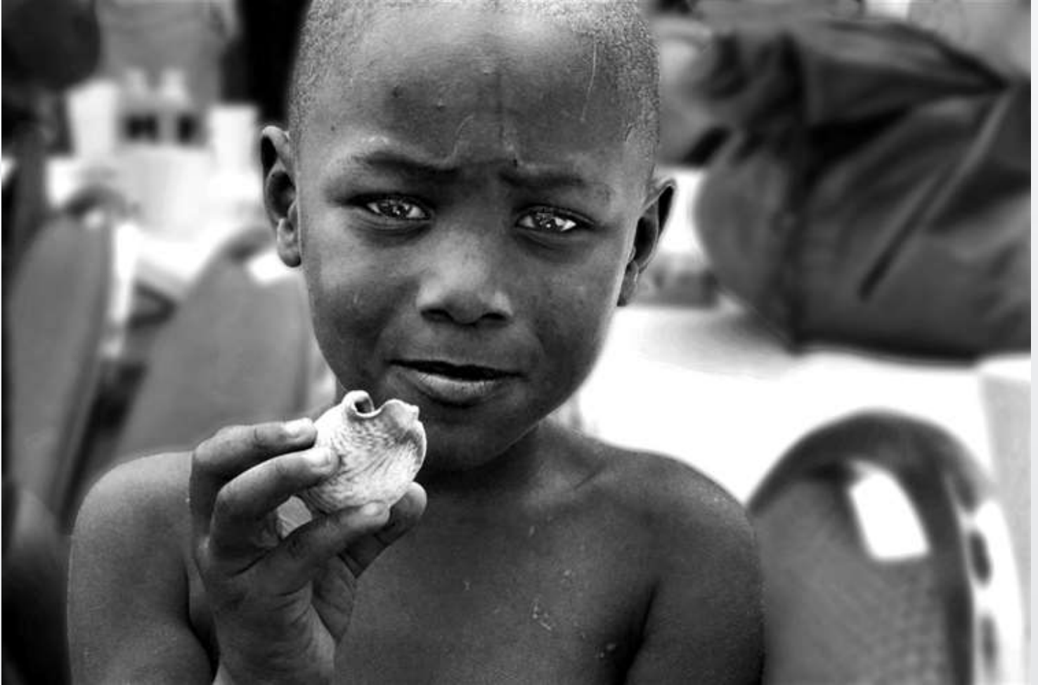
Erin Stensrud Photography “Prized Possession”