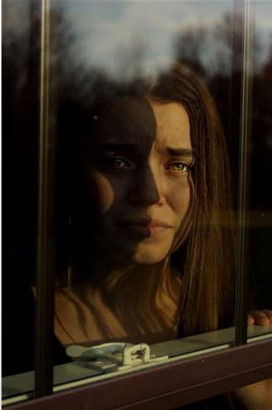
Allison Schy Photography “Negative Space” National Silver Medal