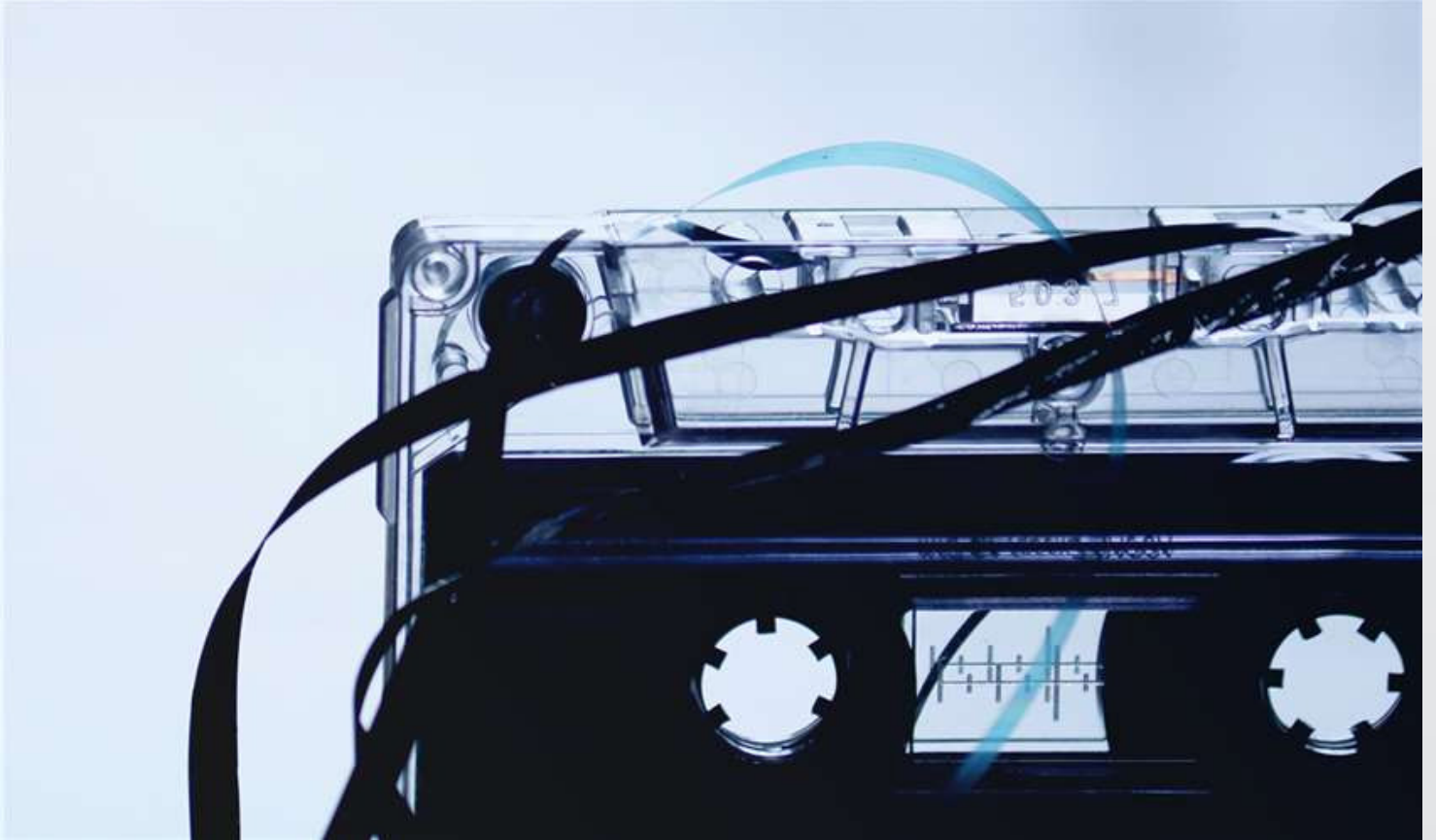
Chris Carter Photography “All Fades Away”