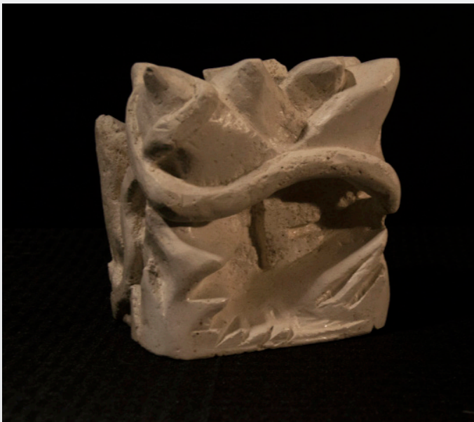
Eunice Song Sculpture “The Hidden Answer” Honorable Mention