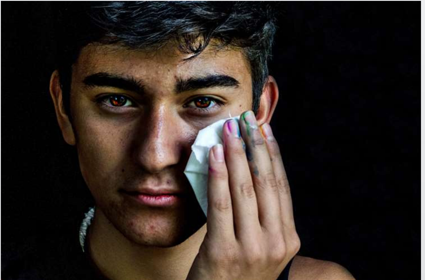
Erin Stensrud Photography “Hidden Colors”