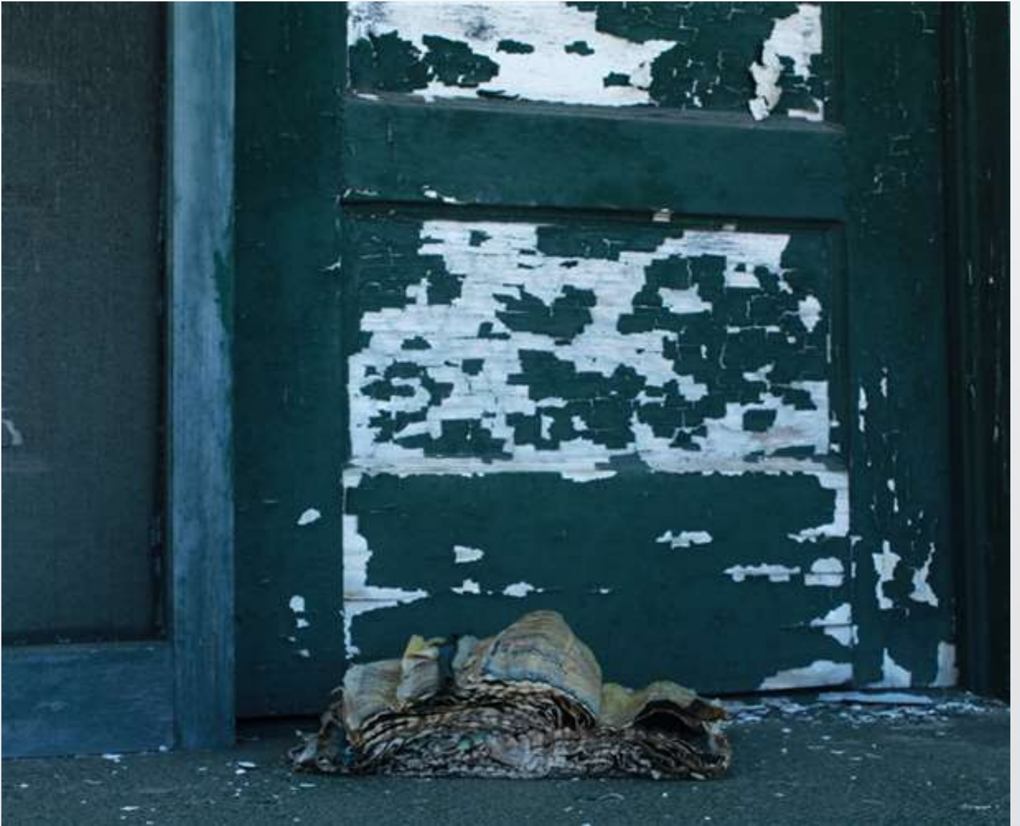
Jordan Sahibi Photography “Burning at the Seams”