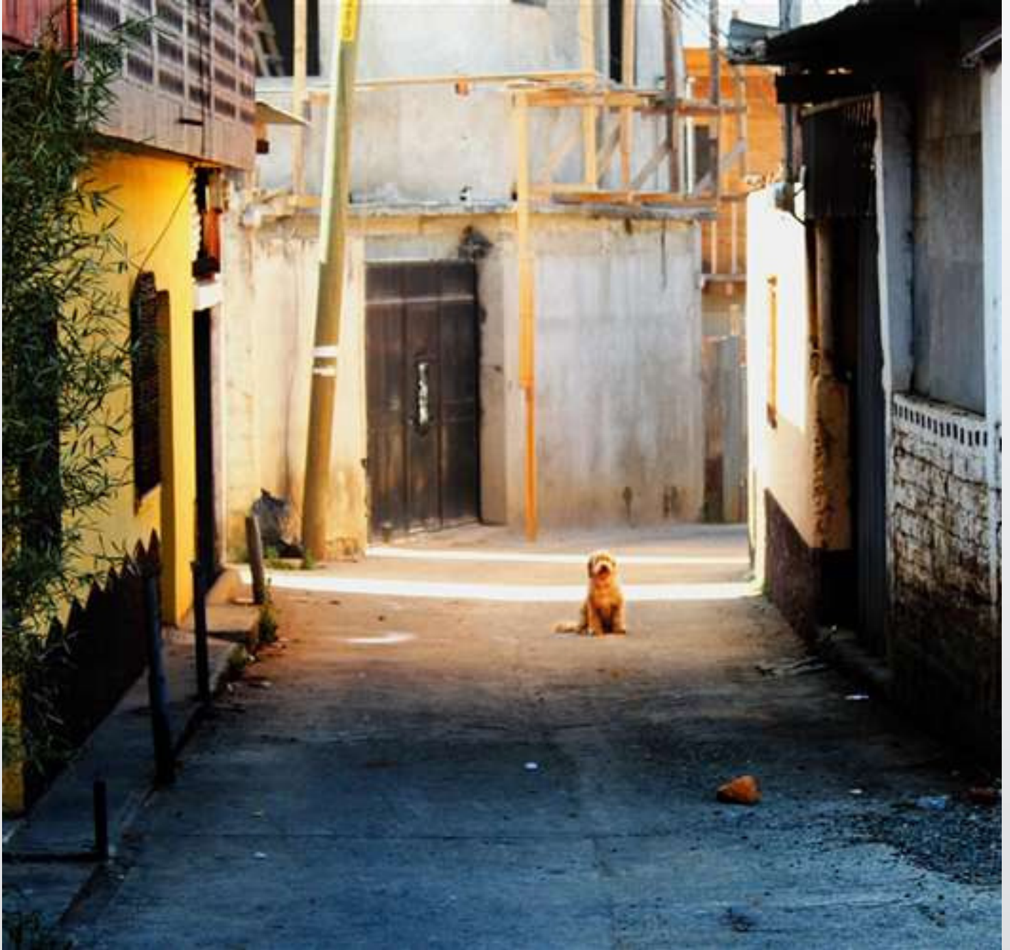
Ashlynn Barrett Photography “Guide”