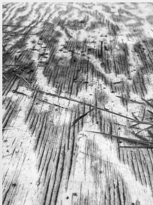
Emma Fletcher Photography “Scratches” Silver Key