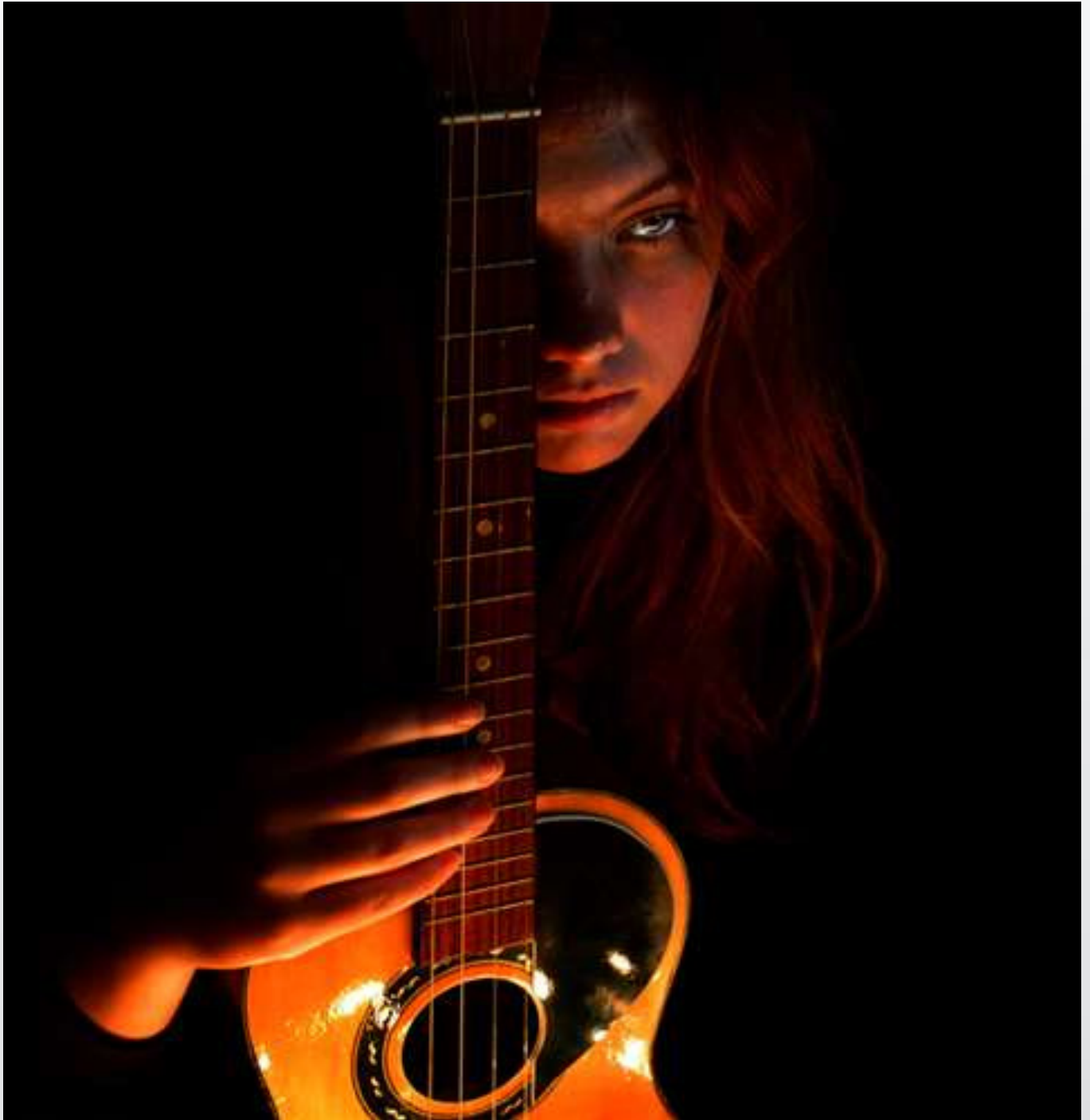
“Zoned Out”