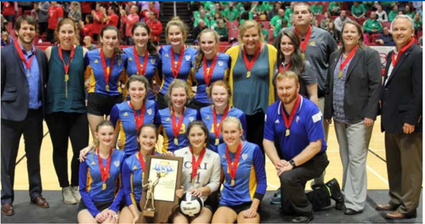
Our Lady Warriors volleyball team made us proud this year with their 34-6 record as they worked hard and represented CAI well! They were 2A State Runner Up. How many daughters of alumni can you pick out of this photo? Hint: there are at least three!