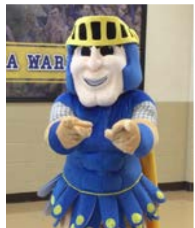
The CAI Warrior is back and going strong!

CHRISTIAN ACADEMY Alumni Warriors for Life