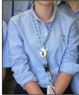
CAI Logo Oxford Shirts

Short or long sleeved in white, navy, or gold