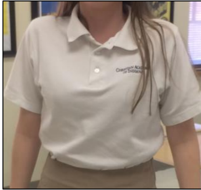
CAI Logo Polo Shirts

Short or long sleeved in white, navy, or gold