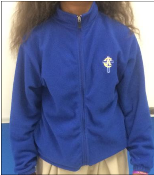
Logo Fleece Jackets