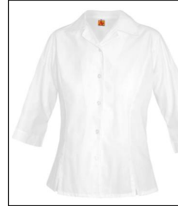
CAI Logo Blouses (girls only)