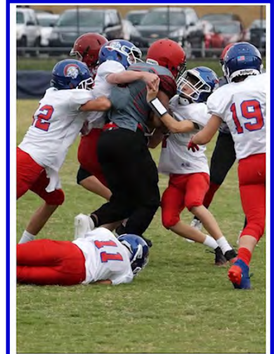
WS player taken down by host of Centurions