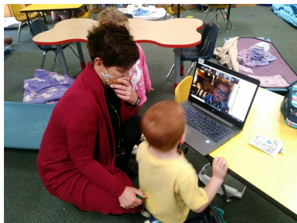
Junior Academy Book Buddies