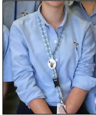
Short or long sleeved in white or blue