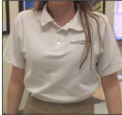
Short or long sleeved in white, navy, or gold