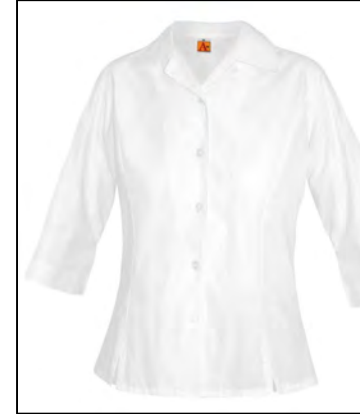
CAI Logo Blouses (girls only)