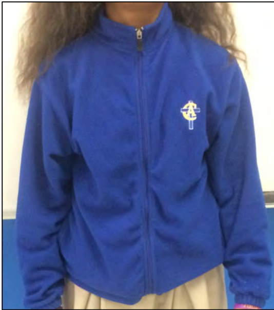
Logo Fleece Jackets