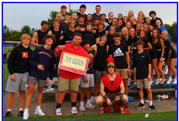
The Legion brought the energy for 80 minutes. Thanks for your support!

On Tuesday, CAL will host Ballard (3-0-0) at 7:30 PM before hosting Evangel Christian on Saturday at 11:00.