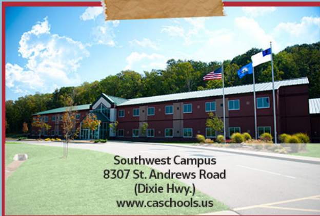
Southwest Campus 8307 St. Andrews Road (Dixie Hwy.) www.caschools.us