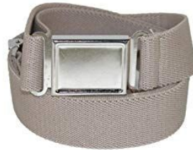
Optional magnetic belt (kids love them!)

Belts –Belts must be worn with all shorts, pants and skirts that have belt loops.