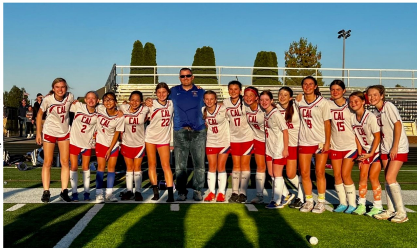
End of Season Drenching of the Coach