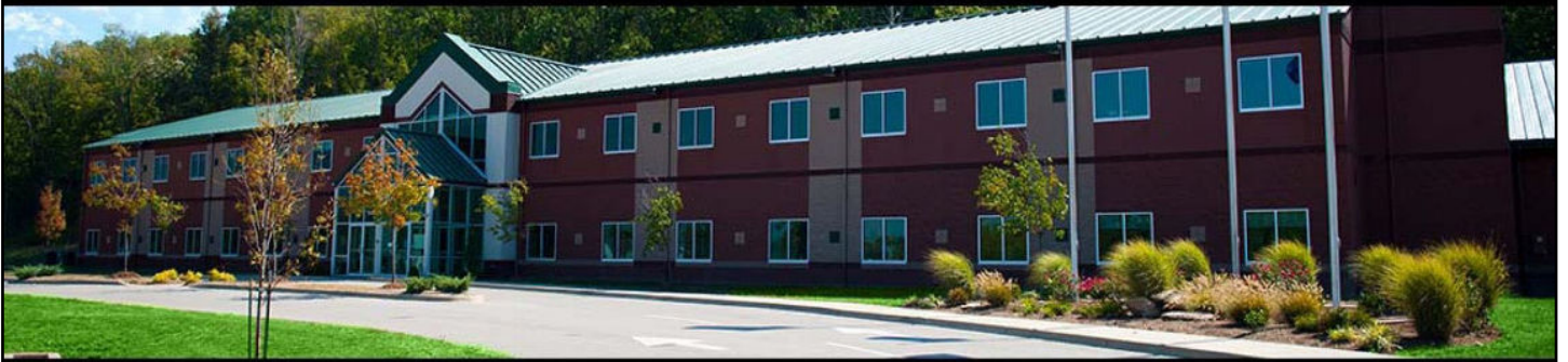
SOUTHWEST CAMPUS March 16, 6 p.m. and 7 p.m.

Do you know someone that wants a Christian education for their child? Invite them to attend our Open House for prospective families on Thursday, March 16! Guests should register online by clicking here .