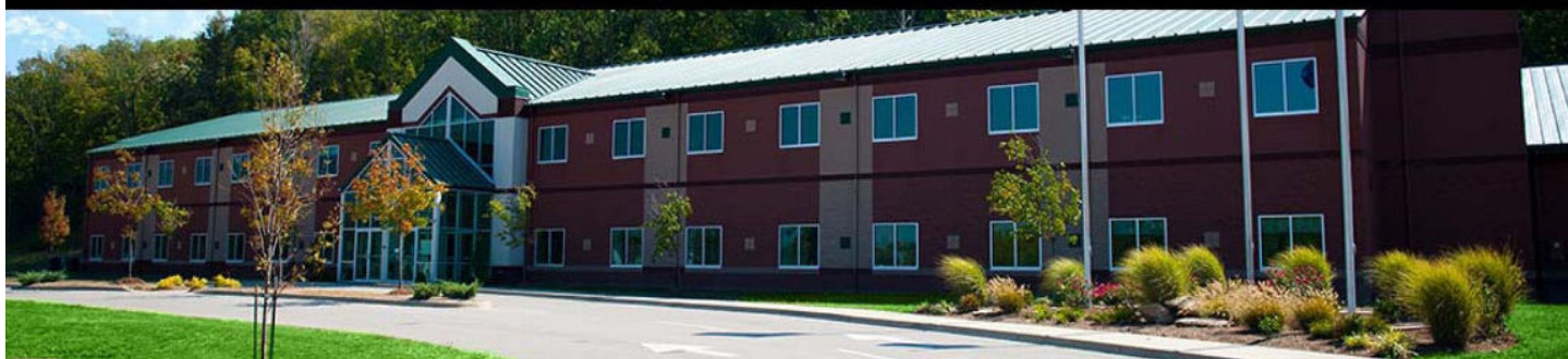
SOUTHWEST CAMPUS March 16, 6 p.m. and 7 p.m.

Do you know someone that wants a Christian education for their child? Invite them to attend our Open House for prospective families on Thursday, March 16! Guests should register online by clicking here .