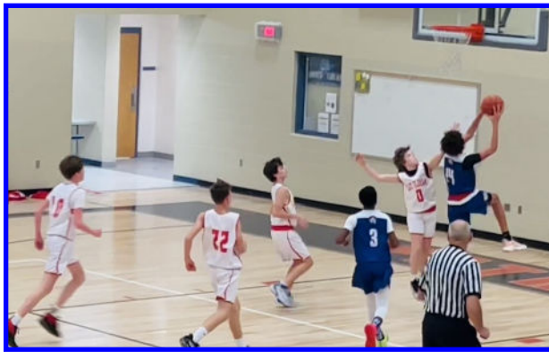
January 5, 2023