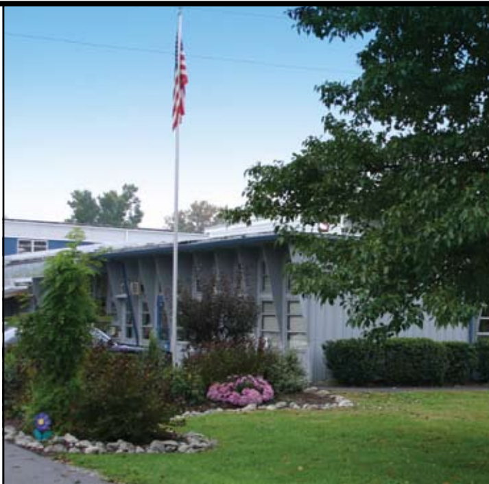
Rock Creek Campus