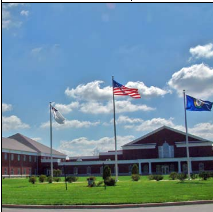
English Station Campus

While book knowledge is learned, your relationship with and faith in God is lived.