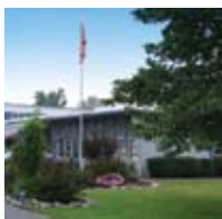
Rock Creek Campus

The Christian Academy School System serves over 3,200 students and their families in preschool through 12th grade on four campuses in the Louisville-Southern Indiana area.