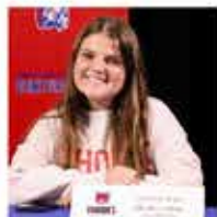
Logan Agee Field Hockey Rhodes College