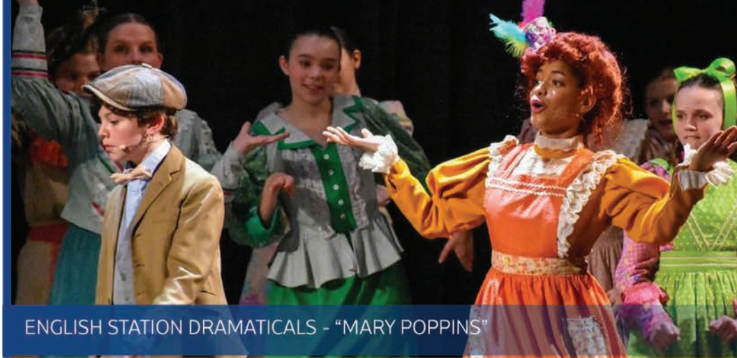
ENGLISH STATION DRAMATICALS - "MARY POPPINS"