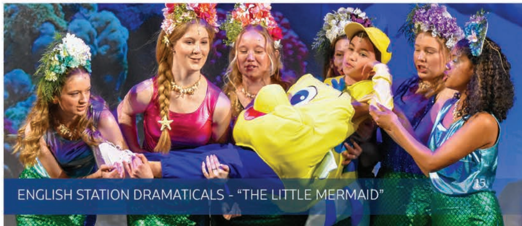
ENGLISH STATION DRAMATICALS - "THE LITTLE MERMAID"