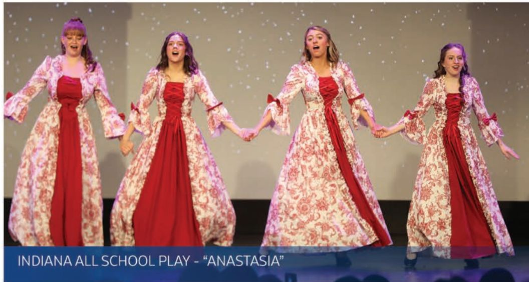
INDIANA ALL SCHOOL PLAY - "ANASTASIA"