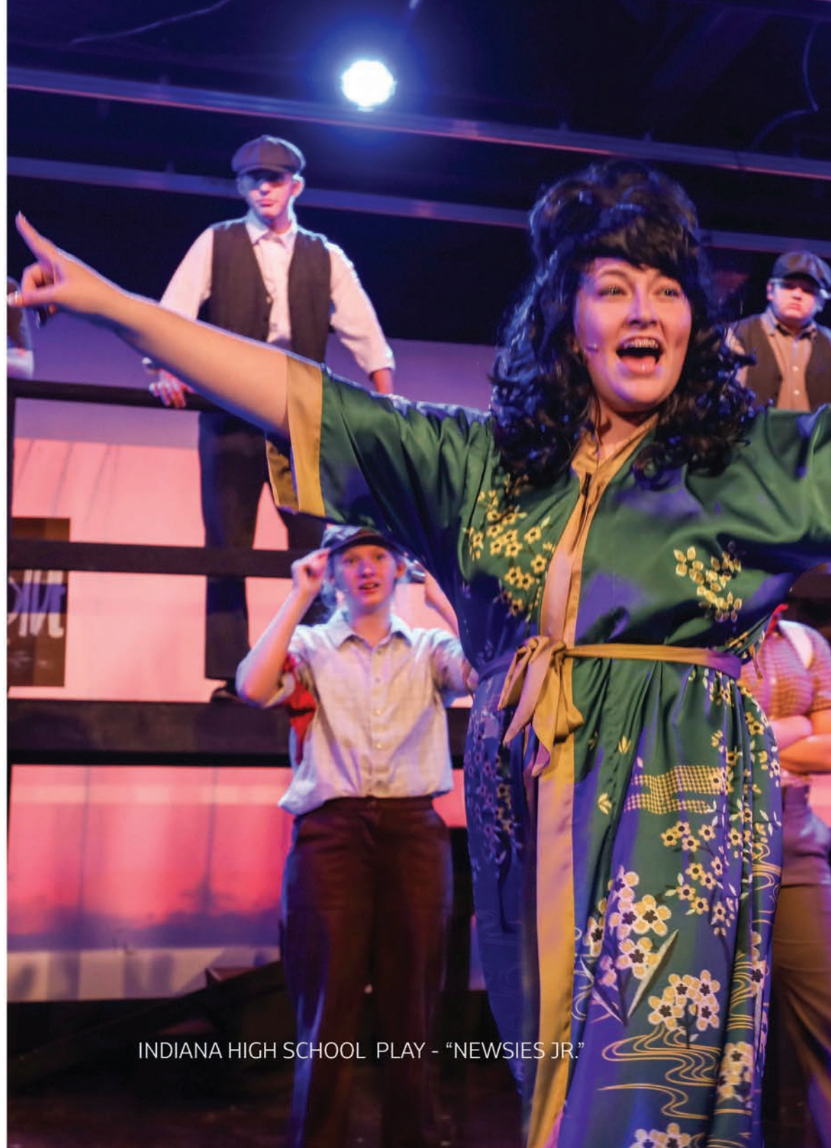
INDIANA HIGH SCHOOL PLAY - "NEWSIES JR."

The Theatre Art Programs encourage students to use their talents for more than just entertainment—they're also about personal growth and making a difference. This commitment to nurturing creativity and faith is being taken to new heights. By providing a space where students can share their gifts and inspire others, these programs are shaping future artists and leaders who understand the power of artistic expression and its ability to touch hearts and minds.