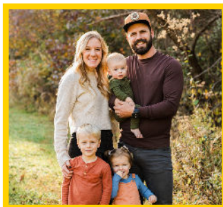
Then and Now