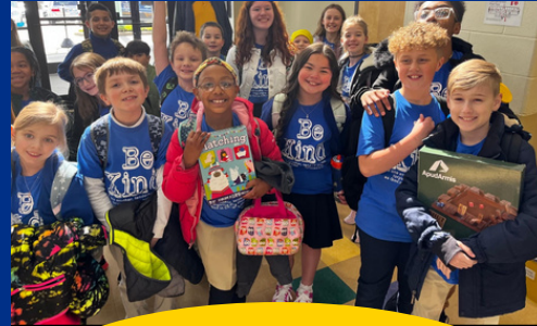
Our Kindness Club spreads JOY at a local nursing home