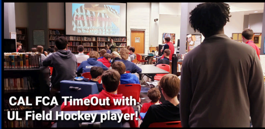
CAL FCA TimeOut with UL Field Hockey player!

CAL TIMEOUT and CALMS FCA held powerful huddles that featured CAL Field Hockey players. We have been equipping our teens to verbally express the gospel and their personal testimonies in an effective way. They are really blooming in this area!