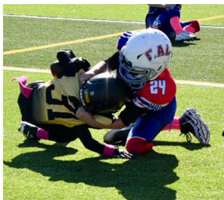
Photo: Youth football parent honored as cancer survivor