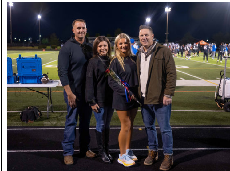
Photo: Girls golf senior night