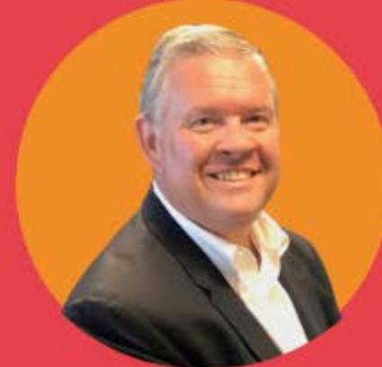
Bill Wozniak INvestEd